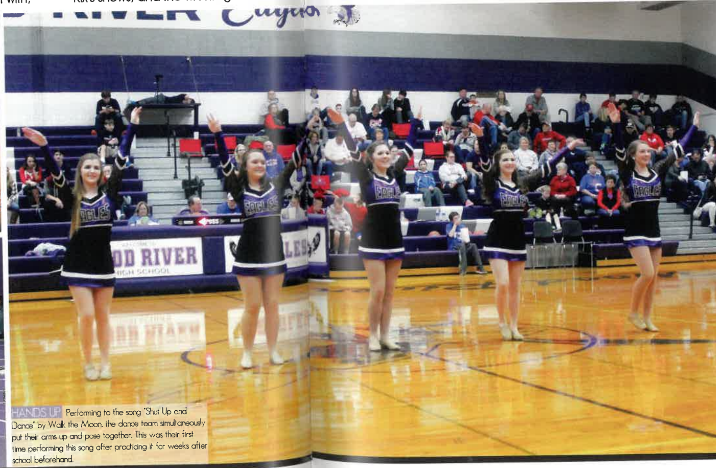
HANDS UP Performing to the song "Shut Up and Dance" by Walk the Moon, the dance team simultaneously put their arms up and pose together. This was their first time performing this song after practicing it for weeks after school beforehand.